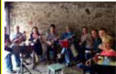
The Hotspot Ukes