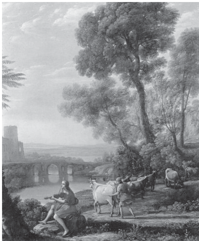
Landscape with Appollo and Mercury (Claude Lorrain)

composition should work as a unified whole, incorporating several elements: a dark foreground with a front screen or side screens, a brighter middle distance, and at least one further, less distinctly depicted, distance. A ruined abbey or castle would add consequence. A low viewpoint, which tended to emphasise the sublime, was always preferable to a prospect from on high. While Gilpin allowed that nature was good at producing texture and colours, it was rarely capable of creating the perfect composition. Some extra help from the artist, perhaps in the form of a carefully placed tree, was usually required.”